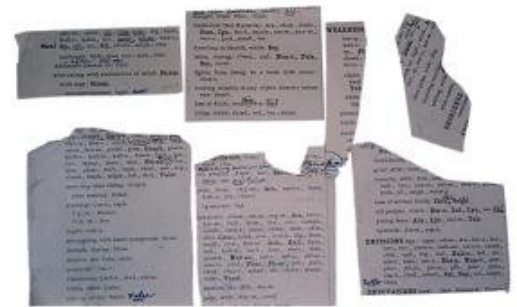
Kent's personal repertory cut to