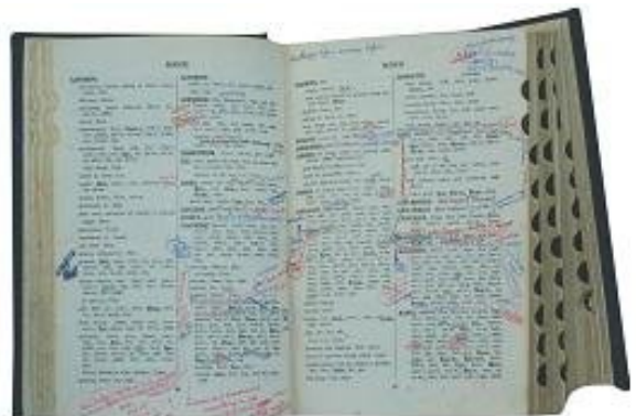
Corrections from Kent's original copied into the book of Dr. Mittal.