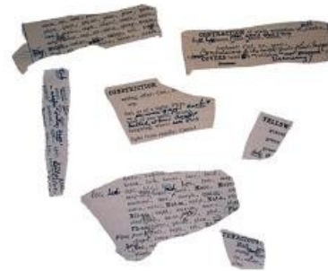
Kent's personal repertory cut to pieces.